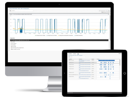
Fault Detection & Diagnostics

Throughout the building design process, the Johnson Controls team offered significant input for the plant design, indoor air quality and control strategies, and collaborated seamlessly with the mechanical contractor, electrical contractor and business consultants. This tight collaboration helped to ensure stakeholder acceptance prior to onsite works and to minimize post completion rework during Beta testing of building systems.